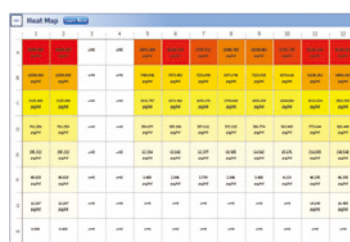
Heat map analysis