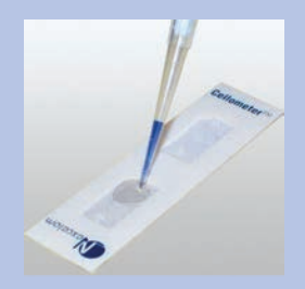
Pipette 20 µl of Sample